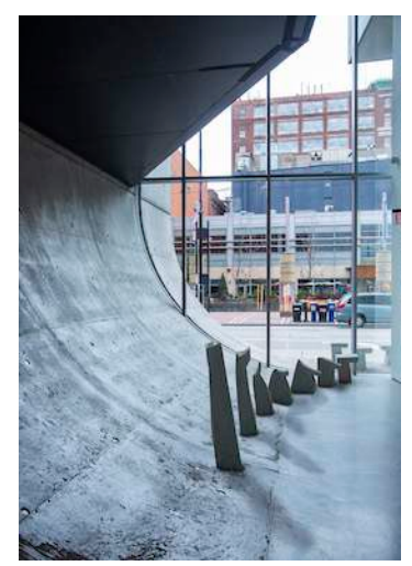
Prop 2 (rendering) Concrete, board, foam Location: Ground floor

"Lauren's uncanny animation of spaces that are habitually overlooked within the museum speaks to a larger, more holistic consideration of an iconic structure that can seem overdetermined, and even overbearing. What happens when the work of a 'starchitect' is interrupted by peculiar agents living in spaces previously unauthorized?"