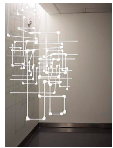
Prop 4 (rendering) PVC pipes, adhesive, metal Location: Women's restroom

Henkin emphasizes that the sculptures in Props aren't designed with traditional beauty or grace in mind; they are literal interventions whose conceptual basis is to encourage viewers to more deeply consider an architect's gestural, formal, and functional intentions. With materials including PVC pipes, wires, and other construction supplies—some even sourced from the museum's own utility closets— Props poses the additional question of how context and presentation affect art-viewing in an institutional setting. Locations and materials range from the mundanely functional (a PVC pipebased work in one of the restrooms) to the dramatic and decorative (a tidy row of concrete mini-monoliths over Hadid's famed "Urban Carpet" in the lobby).